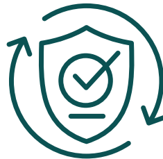
Regulatory Compliance Management