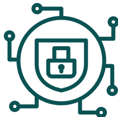
Cybersecurity Risk Management